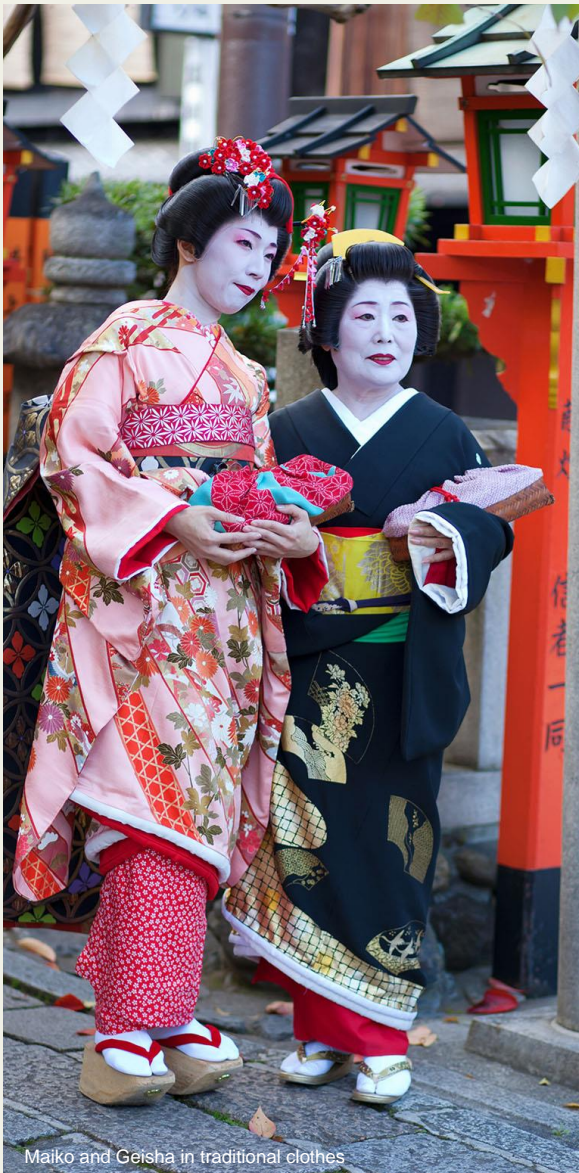
Maiko and Geisha in traditional clothes