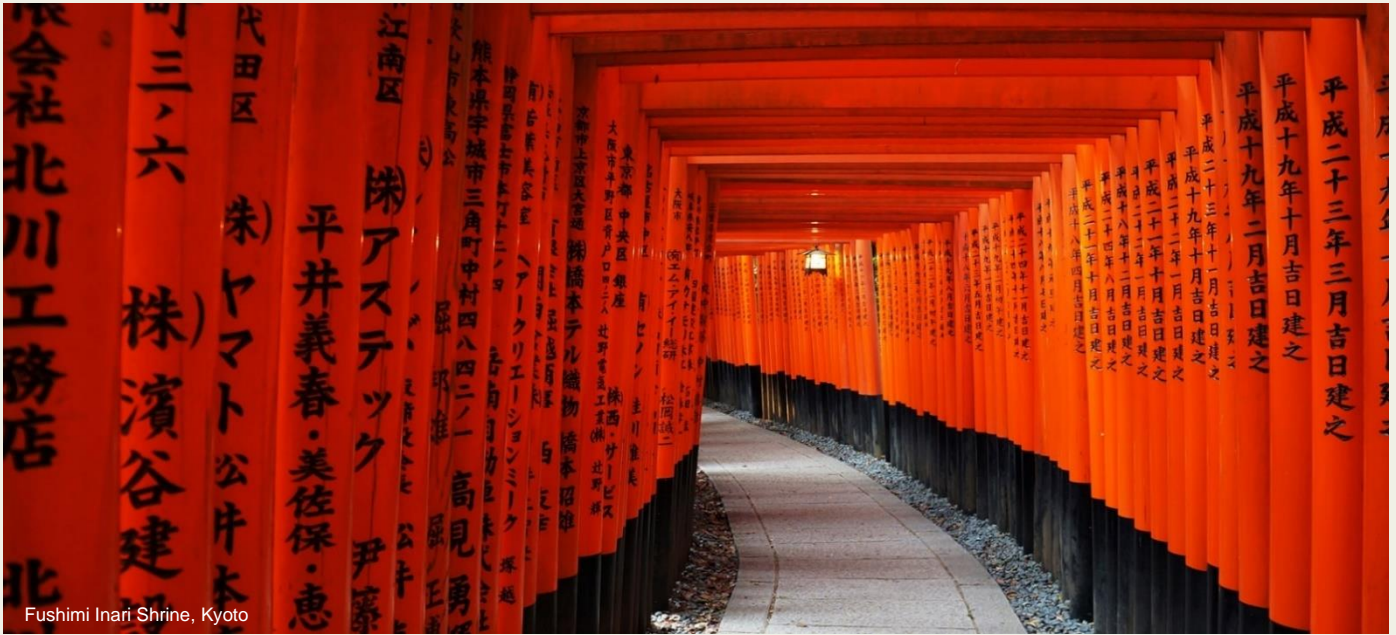
Fushimi Inari Shrine, Kyoto