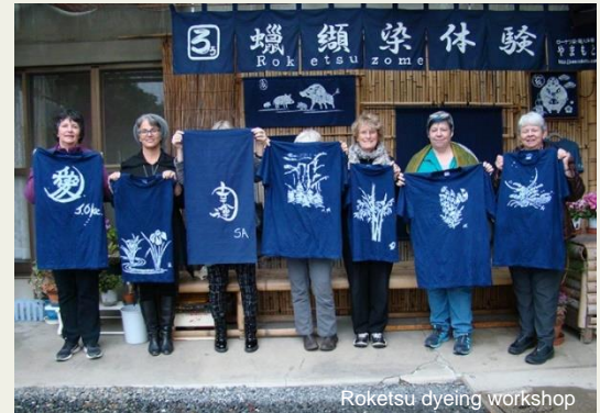
Roketsu dyeing workshop