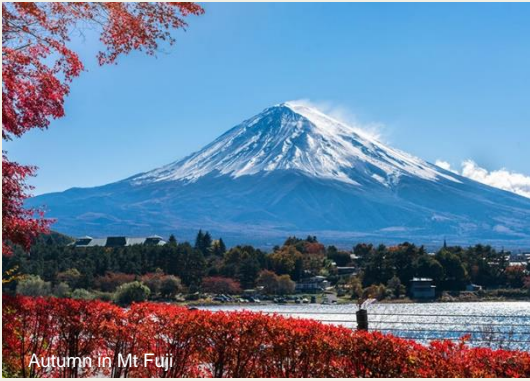
Autumn in Mt. Fuji