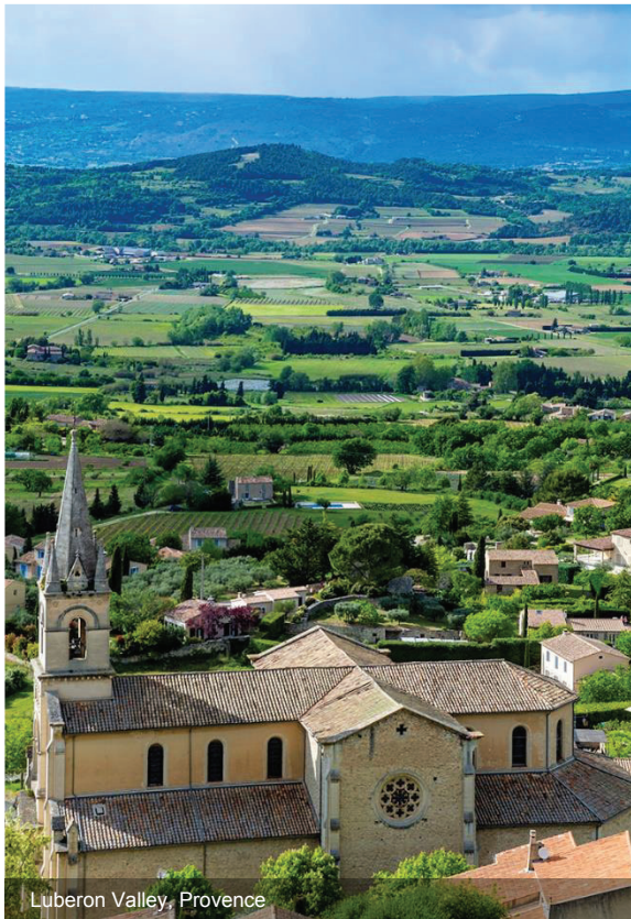
Luberon Valley, Provence