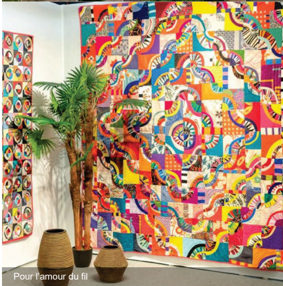
Pour l'amour du fil